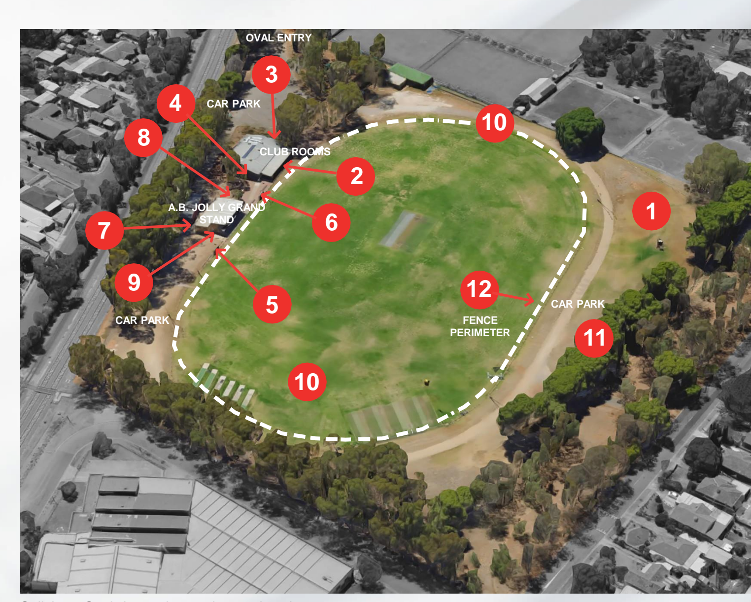
Salisbury Oval: Approximate signage locations