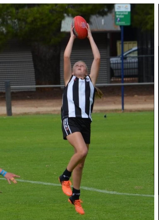
SPONSORSHIP GUIDE - 2024 -