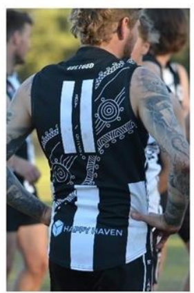
Example of past ANZAC and Indigenous guernseys