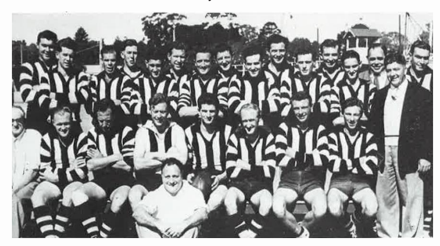
Salisbury FC - 1957